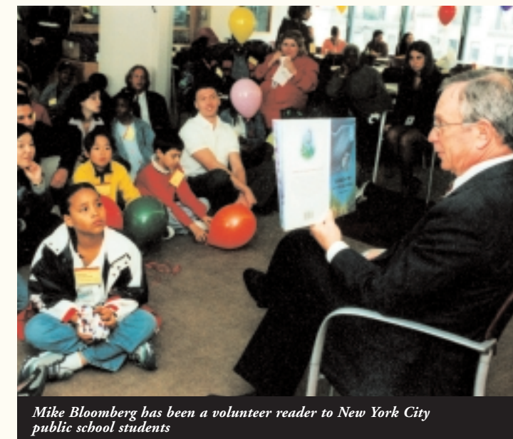
Mike Bloomberg has been a volunteer reader to New York City public school students